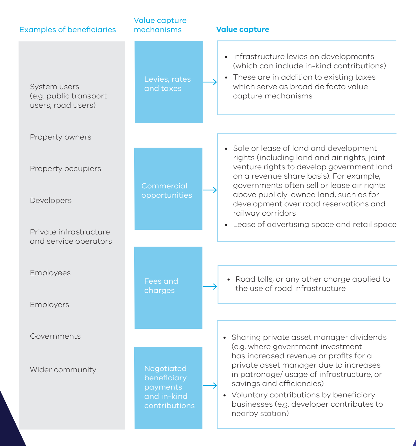
Figure 2: Value capture mechanisms and beneficiaries.